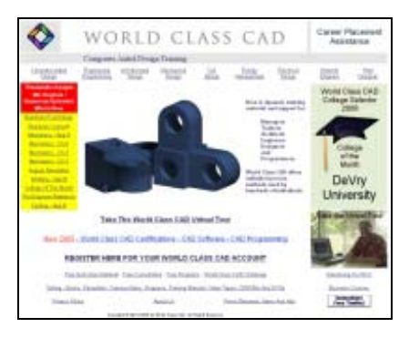
World Class CAD Home Page