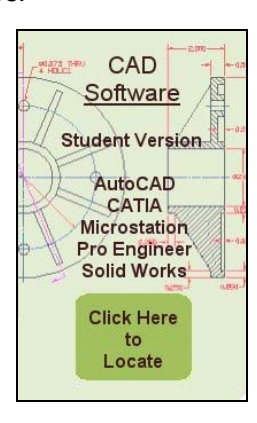
Advertisement for the Student CAD Software

Are you a new student or a professional that wants to learn how to use the new AutoCAD 2007 software? JourneyEd.com has the new software available for purchase, so that teachers and individuals in a training program can practice the worldclasscad.com chapters.