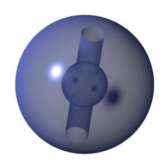
Figure 1.9 – Problem Seven