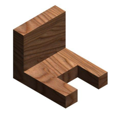
Figure 1.3 – Problem One

The second problem will reinforce the lessons from the first exercise adding a tutorial on the Wedge tool. When you draw a three-dimensional solid in the ten basic training session, you will have a time limit in order to complete the exercise, so you can practice different methods that will achieve the same result. Some designers will draw individual components that bringing together all of the units with the Union tool. Others will create the larger solid, and then place the particles in position that you will subtract from the larger entity. 3D solids that are symmetrical can be made only on one side the centerline and then you will use the Mirror and Union tools to finish the part.