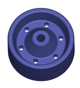
Figure 1.14 – Revolution 2

The last problem in step two has a smaller hub and less detail for the clearance holes on the side shown. The most complex features are on the opposite side of the part, so you have to decide how to draw the solid. The procedure is not hard in AutoCAD, but the sketch in Revolution 3 is opposite in detail than the first two. Determine whether you wish to draw the part upside down to show the additional textures or continue using the exact same method you used in the first two. After saving the thirteen solids, you need to create the thirteen part drawings for each entity in Paper Space.