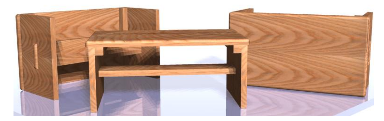
Figure 1.17 – A marketing image of your first simple three dimensional assembly

The last phase of the training involves making simple assemblies for relatively simple part drawings. Your first XREF assembly will be the footstool shown in Figure 1.17. Students and professionals are amazed at the clarity of the marketing images made for the assembly, the ease of documenting each of the solid parts and orthographic drawings, and the effortlessness of making 3D assembly drawings.