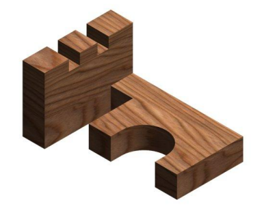
Figure 1.8 – Problem Six