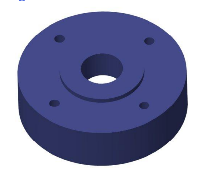
Figure 1.15 – Revolution 3