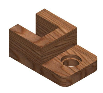
Figure 1.5 – Problem Three

The sixth problem, also drawn in metric, will allow you to use the Rotate3D command to create a unique part. In AutoCAD, many support tools will allow you to move, copy, rotate, align or mirror the solid on the two-dimensional plane. Editing tools like Move, Copy and Align do their jobs outside the 2D plane and are the most flexible in both types of drawing methods. There are special 3D tools accessible primarily for the 3D solid, such as Rotate3D, Mirror3D and 3dArray. Many students find these special commands to be hard to use at first, but with reference to the UCS icon, the tool can be dominated.