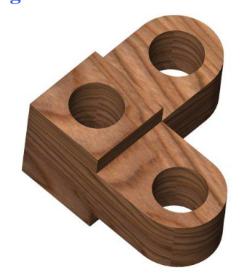
Figure 1.7 – Problem Five