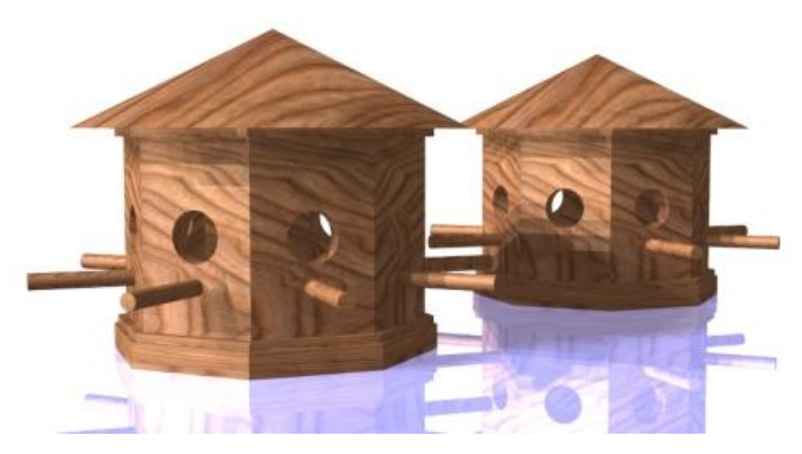
Figure 1.2 – A marketing image of a simple three dimensional assembly

language of engineering has allowed every level of skilled technician to participate, where in the past the design process was privy just to the master artisan. You could say that the strategic use of placing lines, arcs, circles and dimensions on the x and y-axis is responsible for highly accurate parts and assemblies that can be repeated nearly perfectly in the manufacturing process.