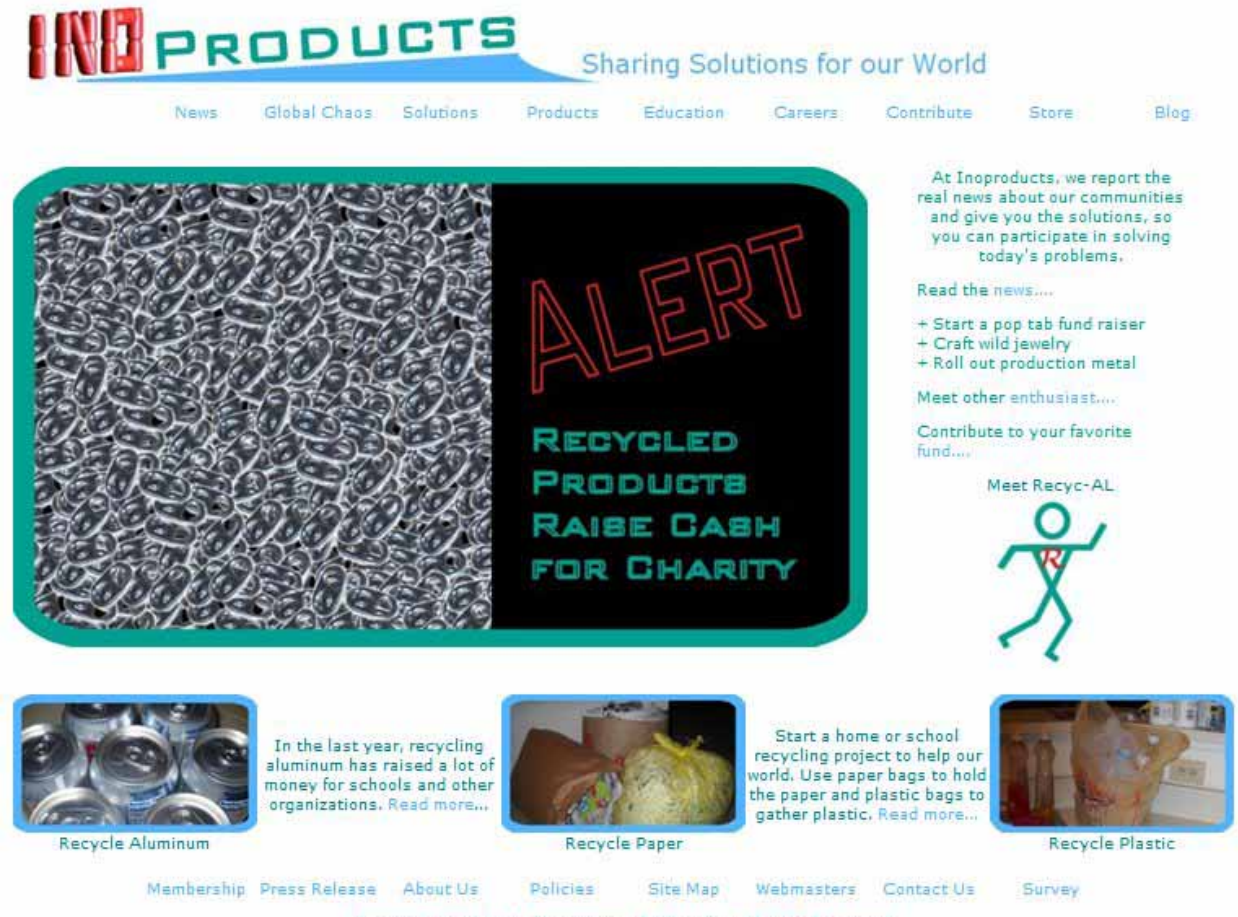
Copyright © 2010 by World Class CAD, LLC, All Rights Reserved,

To get everyone involved around our organizations, we can gather photographs using digital cameras or using an analog camera, developing the film and scanning the photos. We can write creative and entertaining text in Microsoft Word, spell and grammar checking along the way. We can then place the finished graphics; text and pictures onto a Power Point slide.